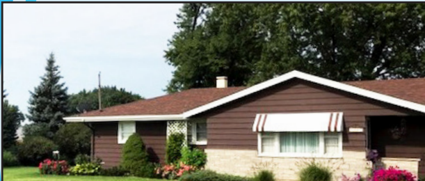
District #3 - Ulmer Residence - 9228 N. Alpine Road