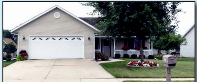
District #2 - Hansen Residence - 593 Gershyin Lane