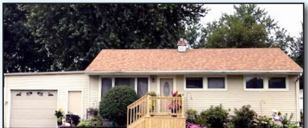
District #6 - Errico Residence - 1215 Colonial Drive