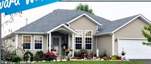
District #1 - Mai Residence - 2960 Vaughndale Drive