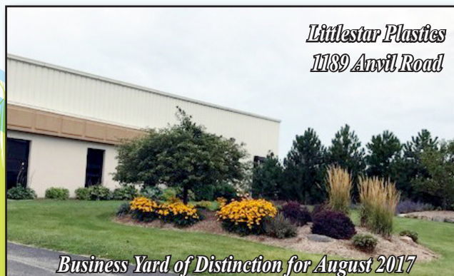
Littlestar Plastics 1139 Anvil Road