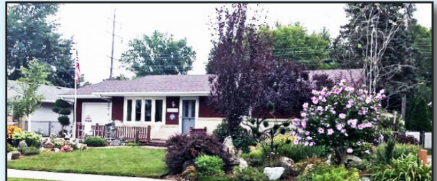
District #4 - Fiepke Residence - 8109 Mildred Road